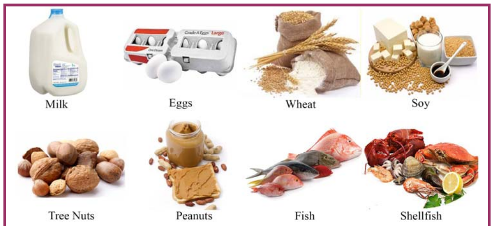
Figure 1. The eight major food allergens pictured account for 90% of all food allergies. The presence of these allergens in a food must be identified on food labels.

Dr. Pamela L. Brady Food Science Department