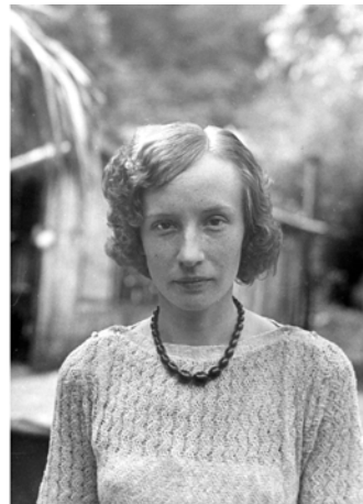
Tatiana Proskouriakoff at Piedras Negras, 1937