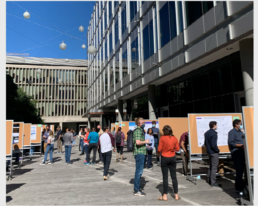
Retreat poster session at SLU Sept. 2021