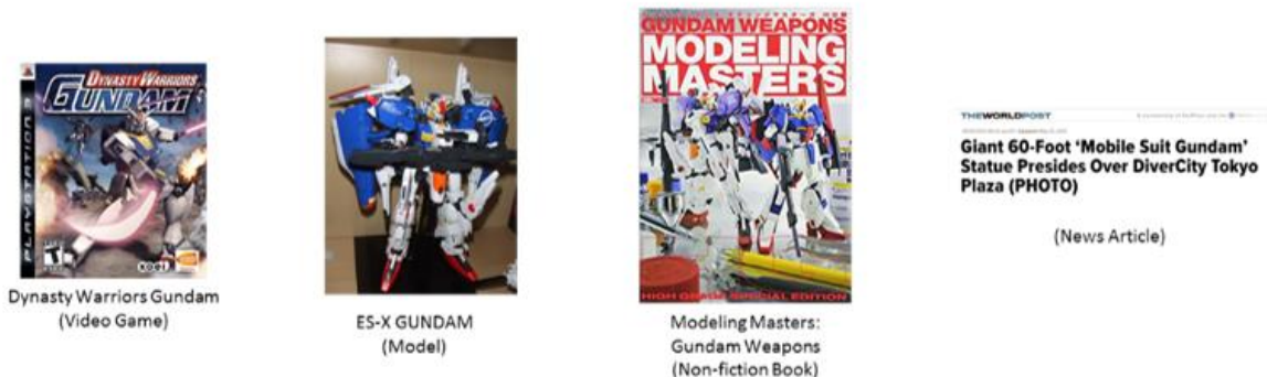
Figure 3. Gundam Superwork Member Entities that Seem to Break Boundaries

The relationships become even murkier as one goes down the list of entities in Figure 2. The list includes music, and so entities like 機動戦士ガンダム 鉄血のオルフェンズ COMPLETEBEST (Kidō senshī Gandamu tekketsu no orufenzu Complete Best), a soundtrack, are among the things included as members of the Gundam superwork, and while that soundtrack directly relates to another work 2 in the same superwork through a part of relationship, it is unclear how it relates to any of the other members. Similarly, the superwork includes entities which cross the boundaries of other works which are members as shown in Figure 3 through the Dynasty Warriors: Gundam video game.