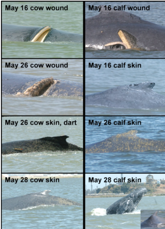
Figure 2. Changes in skin and wound conditions in the mother and calf humpback whale over 16 d

proximity to the whales at source levels exceeding 180 dB re: 1 \mu Pa. After the use of a fire hose on 25 May, the whales turned 90° towards the bank of the river, and then turned back north at 100 m from the fireboat. This intervention was repeated three times, and the same response was observed.