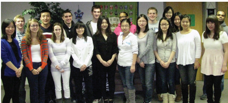
2013 class of inductees.