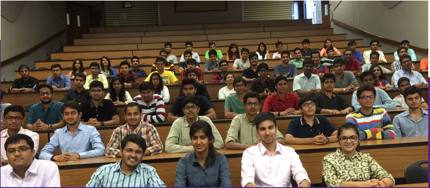
Students from Gujarat Technological University at Kansas State University