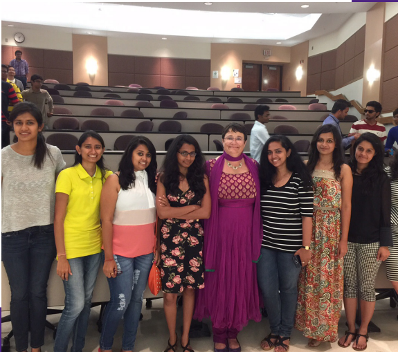
Associate Dean of Engineering Research and Graduate programs.

global.k-state.edu/conf/gtu/docs/manhattan.pdf