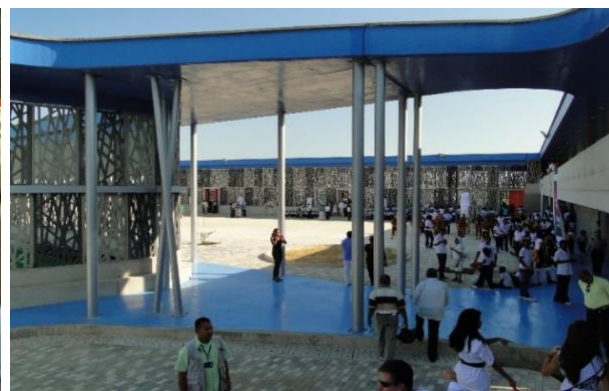
Institución Educativa Flor del Campo. Cartagena. (right)