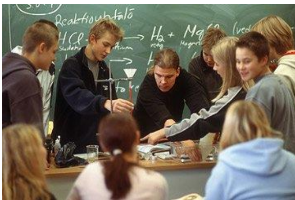
Students at Kirkkojarvi School. Helsinki, Finland (left)