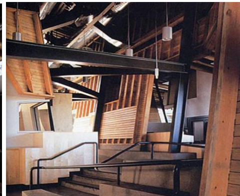
Strawberry Vale School. Victoria, BC. Canada. Patkau Architects. Vancouver, BC. Canada