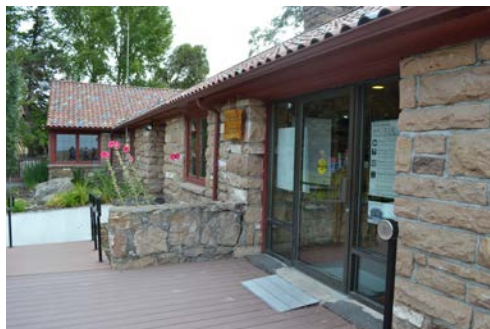
Headquarters, CCC project from the 30s