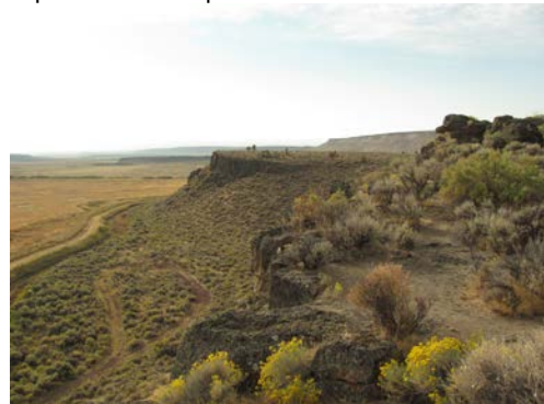
Rim rock landscape – sagebrush plateau