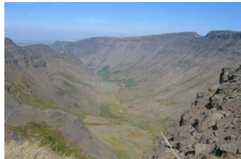
Steens Mountain landscape