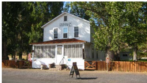
Historic Frenchglen Hotel