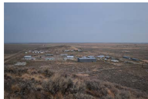
View of the Field Station from Coyote Butte