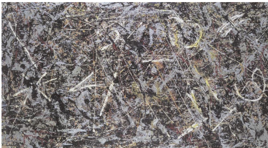
Figure 1 Alchemy , painted by Jackson Pollock in 1947. Drip paintings of this period are characterized by fractal dimensions close to 1.5. Reproduced by permission of ARS, NY and DACS, London, 1999.

With the subject fixating at the centre, a windmill pattern is presented that slowly rotates at 0.2 Hz in one direction for 5 s, and then in the other direction (Fig. 1a). If this is followed by a pattern orthogonal to the windmill, namely concentric rings, diverging and converging for 5 s each at 2 Hz, viewing a blank screen after the concentric rings causes a vivid after-effect of a stationary windmill for a few seconds. This after-effect is quite different from that seen after viewing the concentric rings alone at 2 Hz, if indeed any after-effect is visible. With a cyclical presentation of the sequence shown in Fig. 1a, a striking windmill-like after-effect is always seen after the concentric rings (bottom left blank in Fig. 1a), but no comparable after-effect is visible immediately after the windmill (top right blank in Fig. 1a). We found that the after-effect could be produced if the rings were delayed by up to 30 s, but not after 60 s.