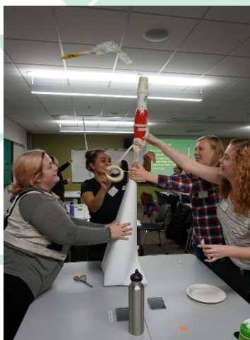
Building the tallest tower team building activity at the fall meeting.