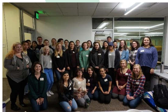
All JUMP! mentors and mentees at the Fall 2017 cohort meeting.

Mentorship primarily takes place via individual and small group meetings. JUMP! mentors also run workshops on specific topics each quarter. For example, two mentors held a successful resume workshop during winter term, where mentees learned some keys to successful resumes and CV's and received valuable, hands-on feedback.