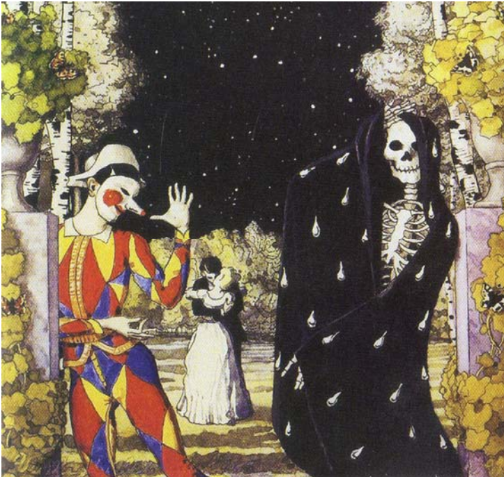
K. Somov. Harlequin and Death. 1907