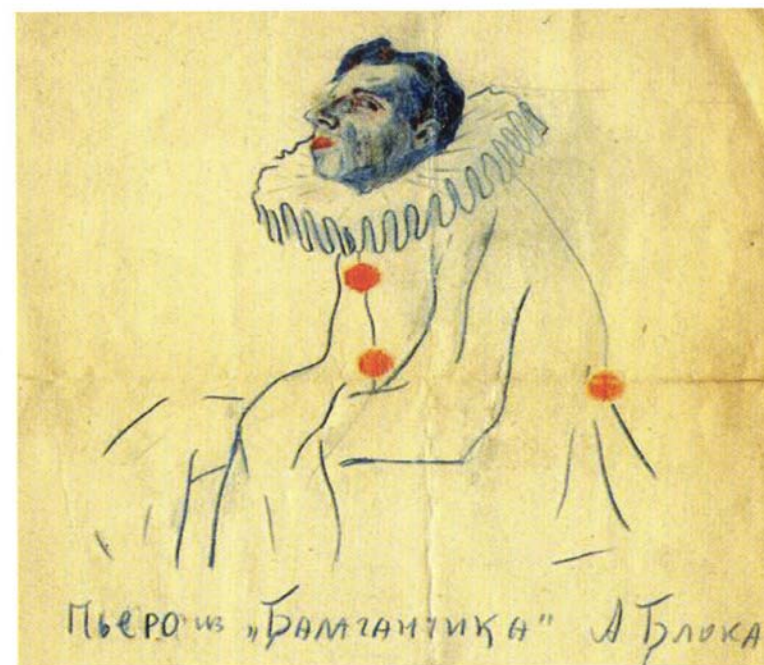
N. Ulianov. Meierhold as Pierrot. 1908

Mystics of all convictions wait for Death the Deliverer to save them from the major world cataclysm. They see a beautiful maiden and beckon her. They implore her to take them away from the world. Young Pierrot tries to persuade them that the lady they see is not Death but his bride, Colombina. Colombina and several street girls like herself try to seduce Pierrot and the mystics, but to no avail: after a shock brought about by their encounter with reality, mystics go back to believing that the girl they see is Death, and Pierrot believes she is his bride. The girl follows Pierrot and promises to never leave him, but as soon as she spots handsome and athletic Harlequin, she abandons Pierrot and has a passionate relationship with Harlequin. To his surprise, after their fun ride in a cabman sleigh Harlequin finds out that he is hugging a cardboard doll. Desperate Pierrot writes to Dear Abby column and eventually sees a shrink who offers his own version of the events: he claims that Pierrot makes the cardboard girl story up because he is in denial of what had really happened and on top of that has a homosexual attraction to Harlequin.