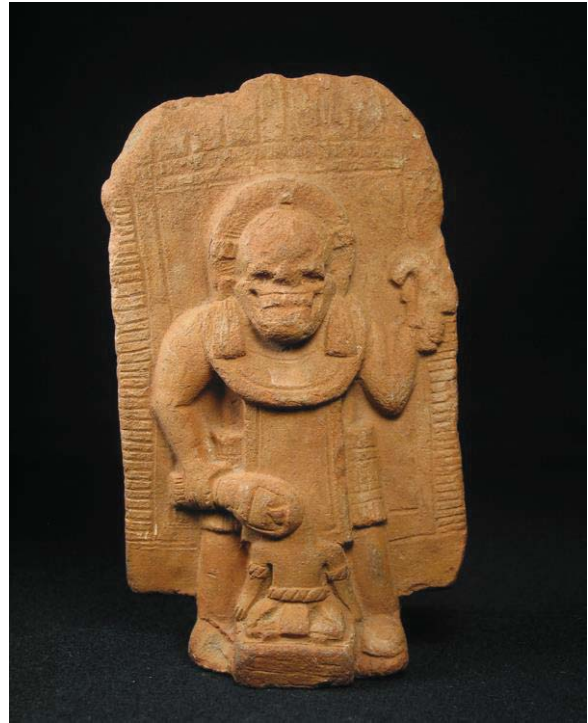
Late Classic Fine Orange Ware mold-made figurine depicting Ah Puch, God of the Underworld, holding a votive knife in the left hand, with subjected infant sacrificial victim. Figurine photo courtesy INAH Campeche Museum.

While seventeenth to mid-eighteenth century British, Dutch, and French nautical charts record the place name Hina while searching for logwood, this point of reference fused reconnaissance and oral historic accounts. Jayna, transformed from "Hi-Na", is the Spanish transcribed term from a European buccaneers' pronunciation of the original toponym, dates to late eighteenth century Spanish New Spain's charts, and morphs into Jaina thereafter. Marl, maize, life, death and rebirth, and polyglot renderings from pre-Columbian Maya to historic British, French, Dutch, and Spanish temporal frames all imbue meaning to this unique gateway to the Underworld.