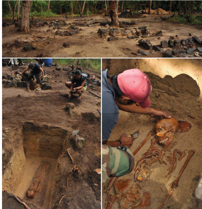
Excavations at Le Morne Old Cemetery, believed to be the burial ground of a post-emancipation former-slave community. The cemetery falls within the buffer zone of the Le Morne Cultural Landscape World Heritage Site, commemorating maroonage and resistance to slavery.

Perhaps unsurprisingly, given the mass diasporas that catalysed its modern population, the island is now home to an incredibly wide array of ethnic groups (one of the most diverse in the region based on this project's own genetic studies). Furthermore, in the absence of any indigenous population, Mauritius also offers a unique testing ground for addressing issues of human impact on ecology. In 1810 the British, who were flooding Europe with cheap sugar, captured the island. Mauritius became a critical component in this industry, producing ~10% of the world's sugar in 1859, a staggering figure for a landmass only marginally larger than Los Angeles. The results were ecologically disastrous, for one, the island's forest were decimated and reduced from ~98% to 2%. The MACH project ( www.stanford.edu/group/mauritianachlgy ) is adding to the growing body of research addressing the consequences of colonisation on the modern population and ecosystem. In particular, it focuses on contributing to our understanding of the transition from a slave workforce to 'free' labourers, a subject that has equal significance to both Mauritian and global communities.