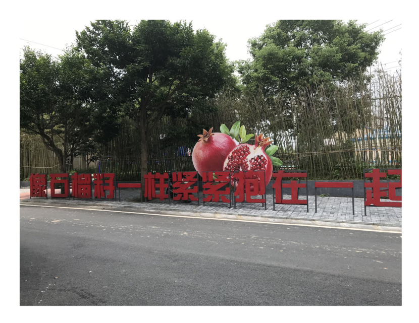
Figure 6. Billboard with the slogan 'be similar to pomegranate seeds and hug tightly together' (xiang shiliuzi nayang, jinjin baozai yiqi 像石榴籽那样,紧紧抱在一起) at the Seven-Colour Forest Village. This CCP propaganda line originates from Xinjiang, as pomegranates are 'Chinese symbols of the exoticism of the region'.