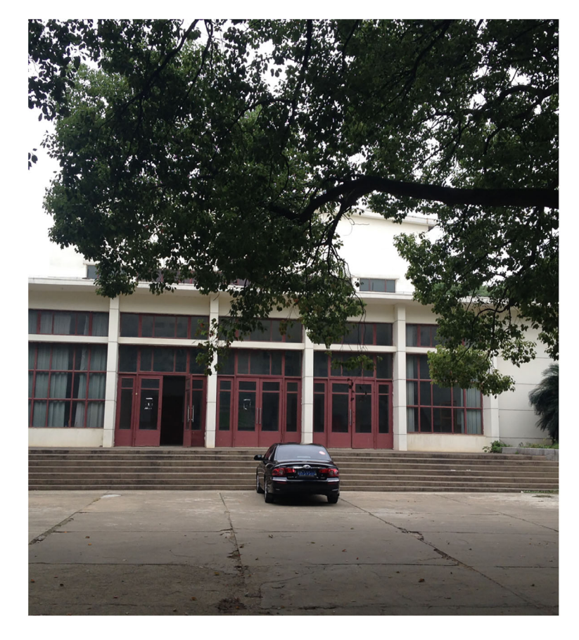
Figure 4. The auditorium of the 510 Office.

more than three decades. Her dedication was underpinned by her lifelong loyalty to the CCP.