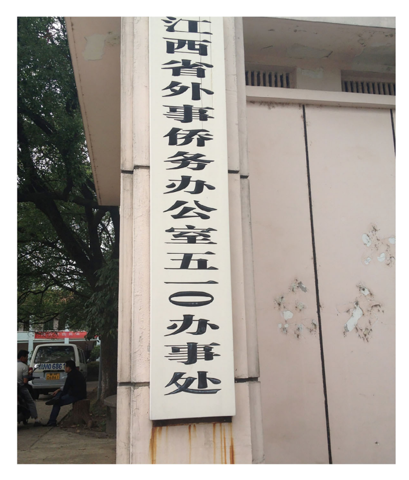
Figure 3. The entrance to the 510 Office. The plaque reads 'The 510 Office, the Foreign and the Overseas Chinese Affairs Office of Jiangxi province 江西省外事侨务办公室五一零办事处'.