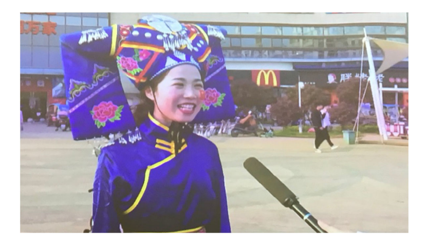
Figure 7. Flash mob multiethnic performance at Seven-Colour Forest to commemorate the seventieth anniversary of the PRC, March 2019.