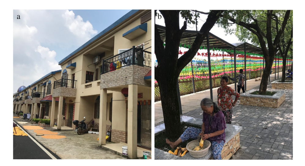
Figures 5a. and b. Identical three-story, cream-colour brick houses with blue rooftops cluster neatly along the village main road, leading to a 'returned overseas Chinese history and culture corridor' (guiqiao lishi wenhua zoulang 归侨历史文化走廊) decorated with bright paper windmills.

employees were still technically serving the only surviving Indonesian exile, who was under palliative care at a Nanchang hospital. In contrast, the Seven-Colour Forest Village has an energetic vibe. Occupying 622 mu (亩) [one mu is equivalent to 666.7 km²] of land on a fertile plain next to a national highway, the Seven-Colour Forest Village consists of 101 households and 410 residents as of 2018. The 'seven colours' refer to Han and six minority groups—Yao, Jing/Kinh/Vietnamese, Dong/Kam, Dai/Tai, Zhuang and Miao/Hmong (see Figures 5a and b).