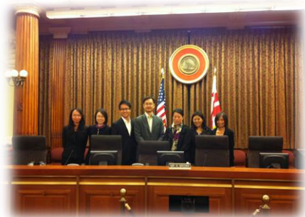
Global Cities Participants in the DC Council Chambers