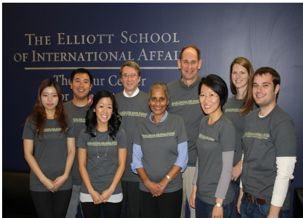
SIGUR CENTER FACULTY AND STAFF MODEL NEWLY DESIGNED SIGUR CENTER T-SHIRTS