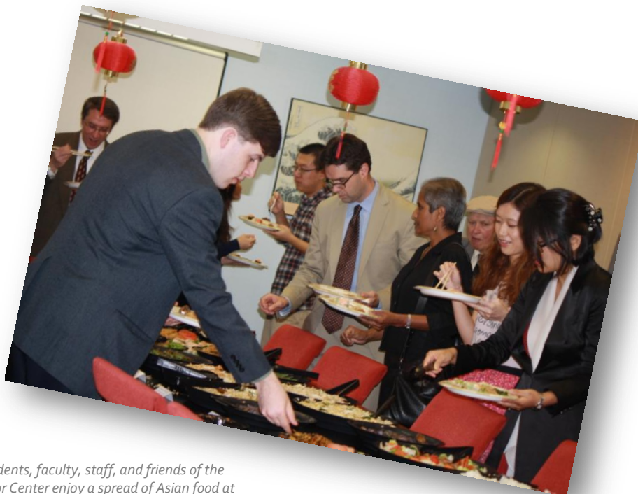
Students, faculty, staff, and friends of the Sigur Center enjoy a spread of Asian food at the Annual Fall Welcome Reception.