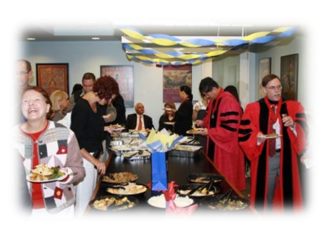
The Chung-wen Shih conference room filled with celebratory graduates, friends, family, faculty, and staff