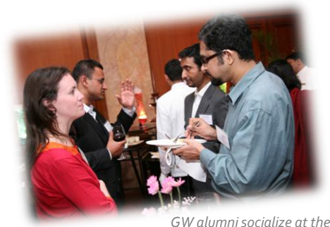
reception in New Delhi

Presented by the GW Office of International Alumni Relations and the Sigur Center for Asian Studies, this alumni reception and faculty panel offered GW alumni in India a chance to re-connect with their alma mater.