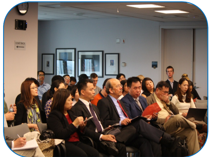
A full audience listens to the panel of experts at GW (3/26/15)

The Obama Administration renewed its efforts to get the Trans-Pacific Partnership (TPP) through Congress last Spring. In addition to being the largest trade deal passed by the U.S. in several decades, the TPP may also serve as the economic linchpin of the U.S. "rebalance" to Asia and is of great importance to many of America's Asian allies. In light of the continuing debate over TPP ratification, the Sigur Center for Asian Studies held a Taiwan Roundtable entitled " Winners or Losers in the TPP? Taiwan, its Neighbors, and the United States ." The panel assembled to discuss the different aspects of this proposed trade deal included Mireya Solís , Senior Fellow at the Brookings Center for East Asia Policy Studies, Shihoko Goto , Senior Northeast Asia Associate at the Woodrow Wilson Center's Asia Program, and Derek Scissors , Resident Scholar at the American Enterprise Institute (AEI).