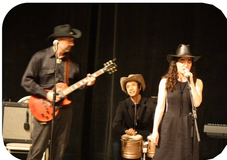
Indonesian rock band The Dangdut Cowboys perform during a two-day symposium on Cosmopolitanism in Practice: Islam and Nation in Indonesia (4/09/15)