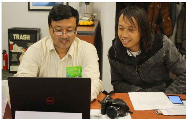
MALICC participants prepare for a press conference simulation exercise.

Since 2007, PISA has organized leadership training institutes on climate change in Hanoi, Washington, DC, Bangkok and Naypyitaw. In November 2014, PISA hosted 14 government officials and civil society leaders for the Myanmar Advanced Leadership Institute on Climate Change, a fast-paced program which included experiential learning site visits, expert presentations, active learning exercises and final group presentations. Read more about the Climate Initiative here .