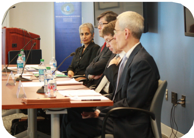
Expert panelists at the RPI Roundtable Energy Security Worldviews in Asia (3/31/15)

On March 31, the RPI hosted a roundtable entitled Energy Security Worldviews in Asia . Three panelists examined how key actors with an influence on energy decision making in Japan, South Korea, and China view their country's energy vulnerability and security, as well the strategies being promoted. Panelists included: