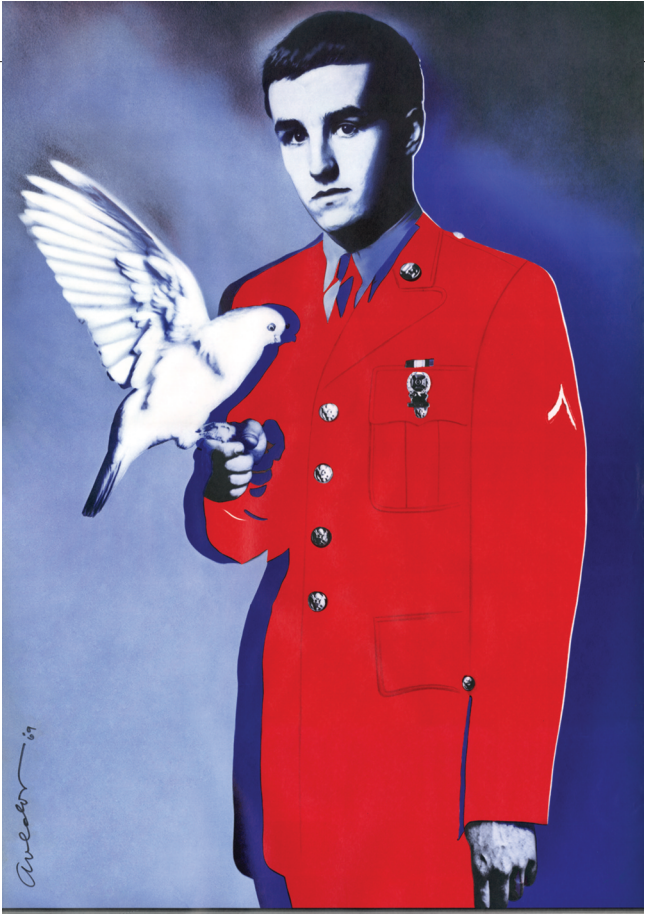
who has a better right to oppose the war?