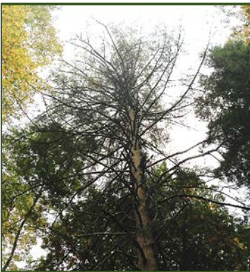
Weakened tree crown, loss of needles in canopy; absence of new green shoots in June