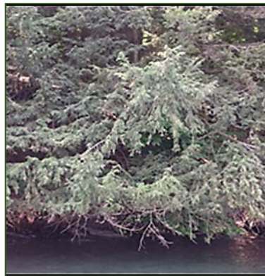
Pale, greyish cast to foliage, easily spotted when boating/from a distance