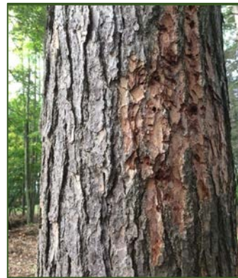
Woodpecker damage from infestation of hemlock borer (native pest)