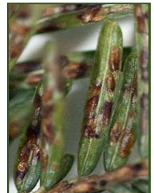
Elongate Hemlock Scale infestation (INVASIVE-REPORT IF SEEN)