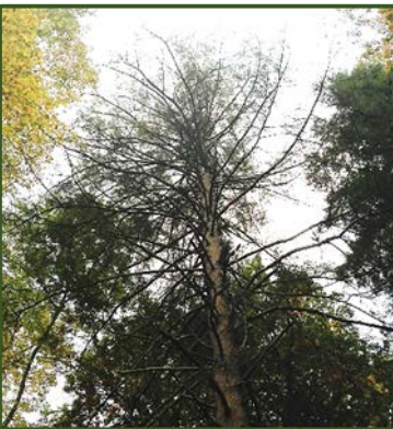
Weakened tree crown, loss of needles in canopy; absence of new green shoots in June