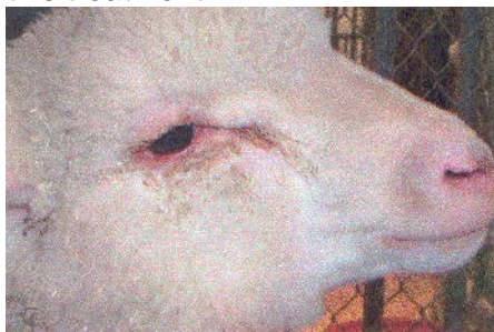
Mild -no treatment

The treated animal will be marked and its number recorded. If there is no improvement in 48 hours, treatment with oxytetracycline will be repeated. A 30 day meat withdrawal period will be respected. Severely affected lambs that will be slaughtered within less than 30 days may be treated with Terramycin eye ointment twice a day instead. There is no listed meat withdrawal for this treatment.