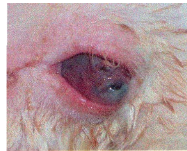
Deformed cornea - call vet

If the animal is worse 48 hours after treatment or no better 48 hours after a second treatment or if the cornea is deformed, with a risk of perforation, a veterinarian will be consulted.