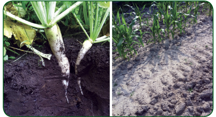
FIGURE 1. Dynamic soil quality - beneficial vs. unfavorable management. Both photos are inherently the same Buxton silt loam.

Left - Management for improved soil health: tillage radish growing in long-term pasture/hay with occasional annual crops.