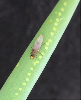
distinctive yellow head alongside diagnostic line of pale green oviposition scars near tip of scallion leaf.