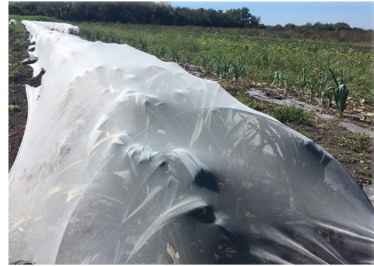
Row cover or insect netting provides a physical Barrier between the crop and insect pests like ALM.

United States Department of Agriculture National Institute of Food and Agriculture