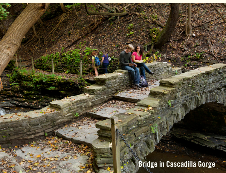
Bridge in Cascadilla Gorge