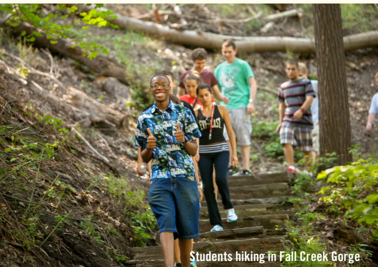
Students hiking in Fall Creek Gorge