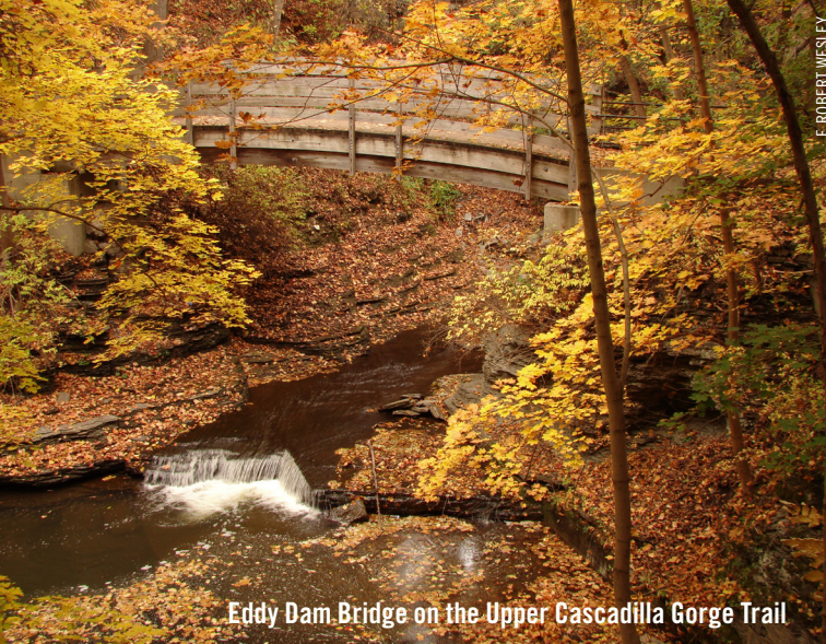
Eddy Dam Bridge on the Upper Cascadilla Gorge Trail