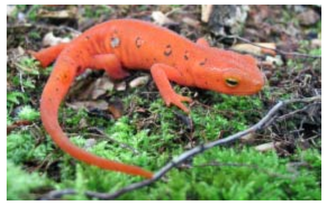
Red Eft: More than two months after hatching, eastern newts transform from aquatic, gilled larvae to air-breathing terrestrials. During this land phase, they are known as efts.

At some point in time, nearly everyone finds enjoyment in wildlife. As a home or landowner, you have the opportunity to benefit from the aesthetic, recreational and economic rewards that come with safeguarding and managing your land in ways that allow for and respect the needs of wildlife.