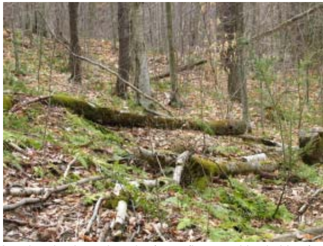
Leaving dead wood on the forest floor provides habitat for amphibians, reptiles, small mammals, and invertebrates.

Landowners who retain a few dead standing trees (away from trails, buildings and other hightraffic places where they might present a safety hazard) will be delighted to see woodpeckers, birds, and other animals feeding on the insects and fungi attracted to the decaying wood.