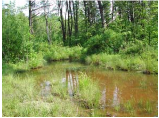
Water sources, such as wetlands, streams, vernal pools, ponds, and spring seeps provide a critical element of wildlife habitat and can provide landowners with many wildlife viewing opportunities.

In some circumstances, it may be feasible for you to create a backyard pond. It need be no larger than 3 or 4 feet in diameter. Some homeowners add small ponds to attract frogs and toads to their gardens. Frogs and toads eat a wide variety of insect pests and slugs. Assistance with planning your pond is available from local agencies including Cornell Cooperative Extension, your County Soil and Water Conservation District, and the New York State Department of Environmental Conservation.