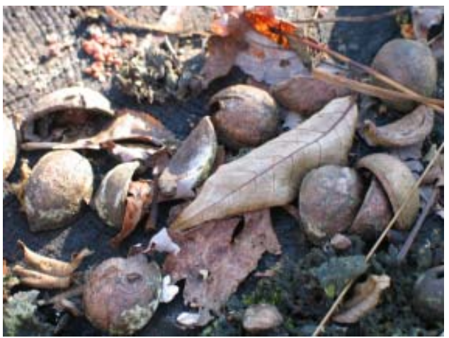
Hickory nuts provide food for many wildlife species.

To provide food for wildlife, promote the health and growth of good wildlife foodproducing trees such as oaks, hickory, beech and black cherry. Nuts, such as acorns, hickory nuts, or beechnuts provide food for chipmunks, squirrels, turkeys, bears, and others. You can