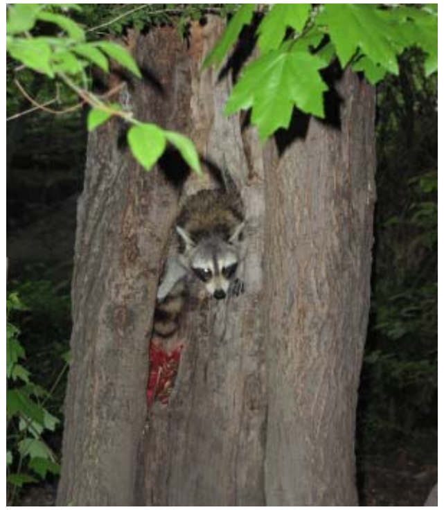
Holes, or cavities, in trees provide refuge for many wildlife species.

You probably know the number of acres your property covers, but did you know that space available for attracting wildlife extends vertically as well? Trees, shrubs, and vines of varying heights provide a full range of 'suites' for animals that climb and fly. The good news is that you can encourage increased vertical structure in your woodland through management practices like thinning - which increases sunlight and in turn promotes understory growth and forest renewal.