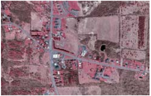
Looking at your property as part of the "big picture" can help you determine what habitat elements are needed. On this map, large, unbroken areas of forest are rare. Maintaining or creating connections among forest patches would benefit wildlife in this area.

Once you have assessed habitat and wildlife on your land, acquire an aerial photo and topographic map of your property. The Soil Conservation District office or the Farm Services Agency (FSA) office in your county or area often has aerial photos for you to view and order. Aerial photos and topographic maps are available on-line at <u>http://terraserver-usa.com/</u>. Get the "big picture" perspective of our neighborhood to determine which habitat