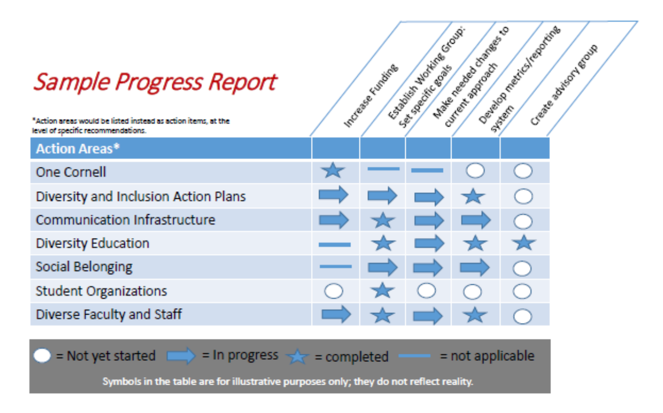
Figure 1. Sample rubric for tracking and communicating progress against goals