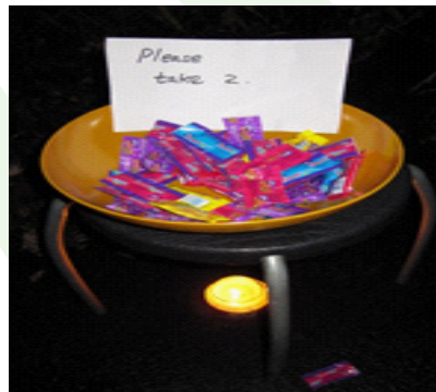
A bowl of candies

Beside carving pumpkins, I was very excited to take children "Trick or treat". In Halloween night, my friend's daughter dressed like witch with a long black dress, a mask and a witch hat. She carried a round orange Halloween bucket to put her treats in. She and some of her friends eagerly ran to knock on the doors of the neighborhoods. The doors opened. "Trick or treat," they said and the hosts were very happy to give them candies. We stopped at a dark house. Maybe, there was nobody inside the house. Surprisingly, we discovered a bowl of colorful candies put on a chair beside the front door with a note "Please take 2".