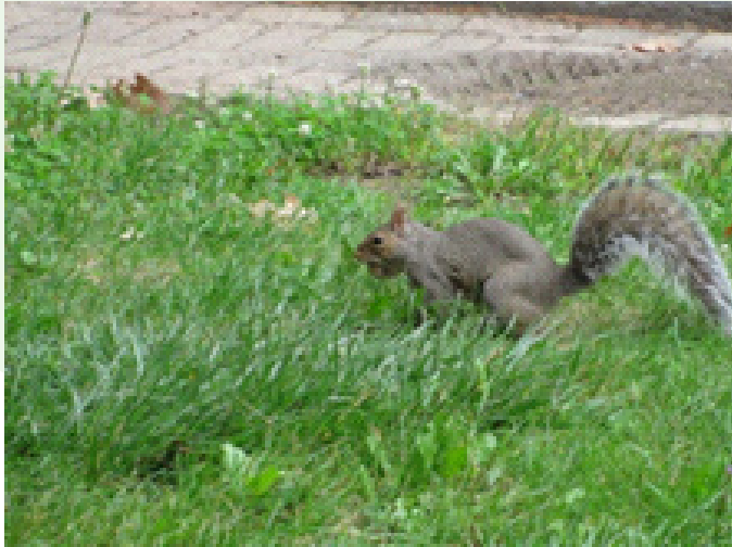
The gray squirrel holds an acorn in its mouth, taken by the author.