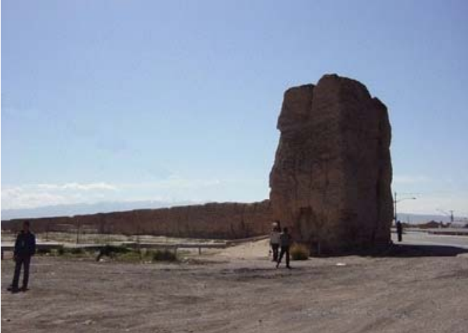
A section of the ancient Great Wall, Shandan, China.

Travel Fever: In this issue read about the places in these photos: the Silk Road in China (p. 2), visiting South Carolina (p. 3) and fun in Hawaii (p. 4) plus a trip to Inner Mongolia (p. 4).