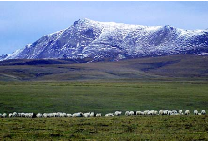
Sheep grazing on the grassland below the snow-topped Qilian Mountains