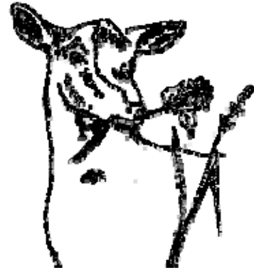
PARTS OF THE DAIRY GOAT