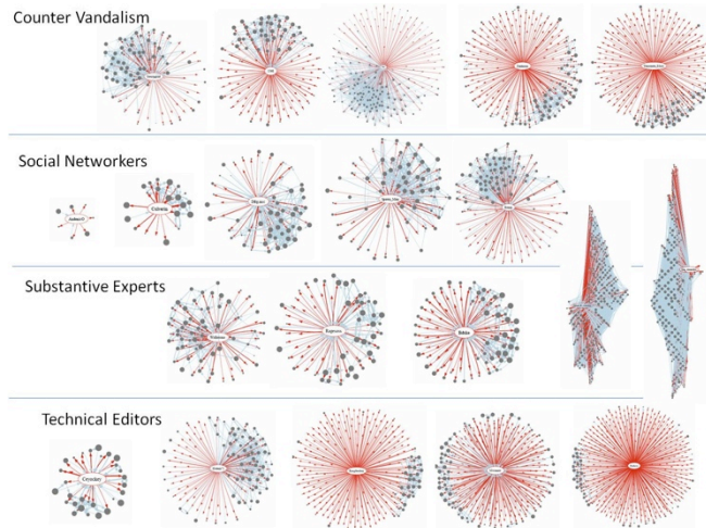
Figure 2. Egocentric user-talk network graphs for role types in directed sample

The counter vandalism and technical editors share several attributes with the local network patterns and neighbors degree distributions of "answer people" [29]. Key features include highly skewed neighbors degree distributions (many ties to alters with few other ties), and very few interconnections in their local networks. This makes sense, both the tasks of reverting vandalism and making small technical edits are likely to put one in contact with a diverse range of alters who lack interconnections, and with alters who may be new or otherwise unconnected to many alters in Wikipedia. However, both technical editors and vandal fighters show evidence of small, highly interconnected subgroups with higher degree alters. This makes sense too, given the complex and user generated rule structure of Wikipedia. All of the technical editing tasks in Wikipedia have an implementation side, and a negotiation side. Even simple editing tasks require some negotiation about how, what and when and where to implement particular rules. More complex tasks, require even more negotiation. So, in general we should expect vandal fighters and technical editors to have many one-off interactions on the front stage, with ongoing interactions with homophilous alters in the backstage.