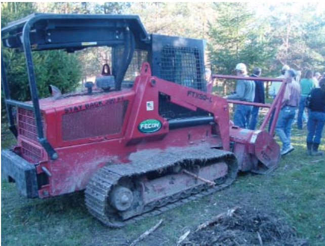
Figure 7. Fecon mower heads can be used for broadcast mechanical, and to some extent selective mechanical treatments of large stems or areas otherwise difficult to access.