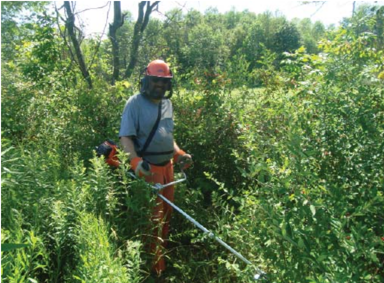
Figure 3. Brush saws can be used as a selective mechanical treatment, or combined with a herbicide to the freshly cut stump to limit sprouting. Personal protective safety equipment is essential.