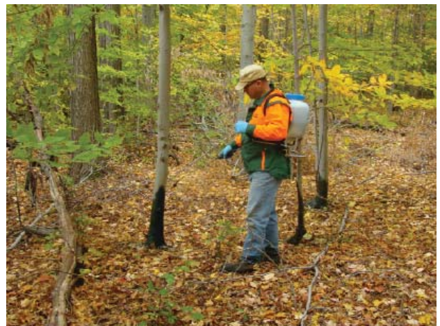
Figure 6. Basal bark treatments use a chemical, often triclopyr, that girdles the stem.