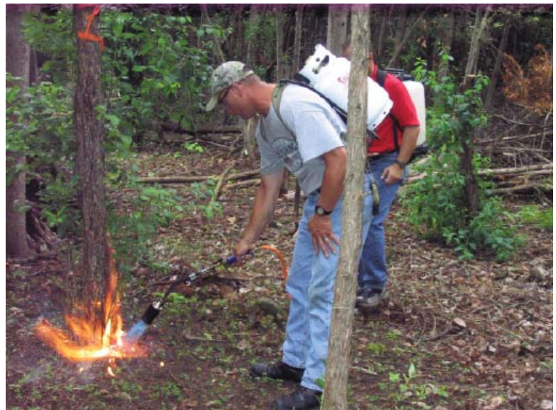
Figure 2. Girdling, such as the flame treatment being used on this buckthorn, kills the phloem and vascular cambium and starves the roots. Girdling at the base of the tree may result in suckers emerging at ground level.