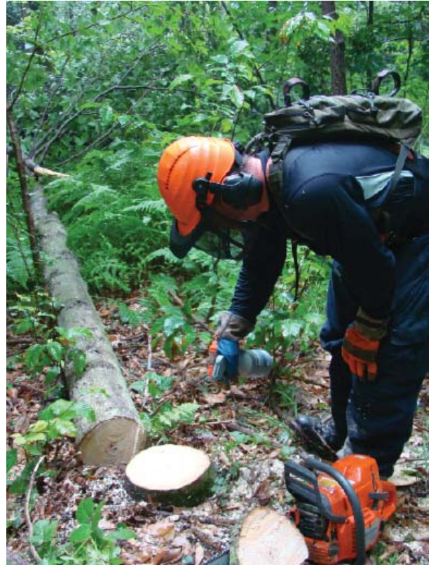
Figure 5. Cut stump treatments are used to control stump or root sprouting that occurs on some species. Personal protective equipment for both chainsaw use and herbicide use need to be utilized.