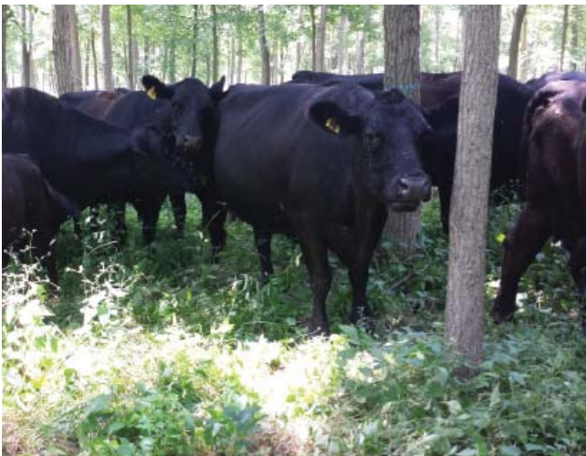
Figure 8. Management intensive grazing (MIG) or mob grazing, if done carefully, can reduce the height and density of the understory. MIG treatments that eliminate the understory would likely damage the overstory trees.