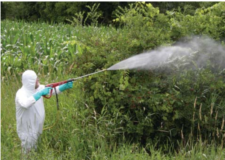
Figure 4. Foliar spray treatment of large plants has the potential for overspray onto nearby plants. Be alert to the proximity of desired plants. The treatment pictured is of glyphosate; the personal protective equipment (PPE) exceeds label recommendations, but can use additional PPE.