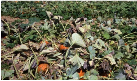
Powdery mildew killing pumpkin leaves in foreground where ineffective product used.