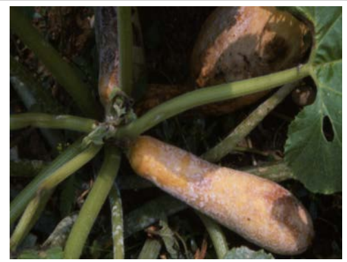
Phytophthora blight affecting summer squash.