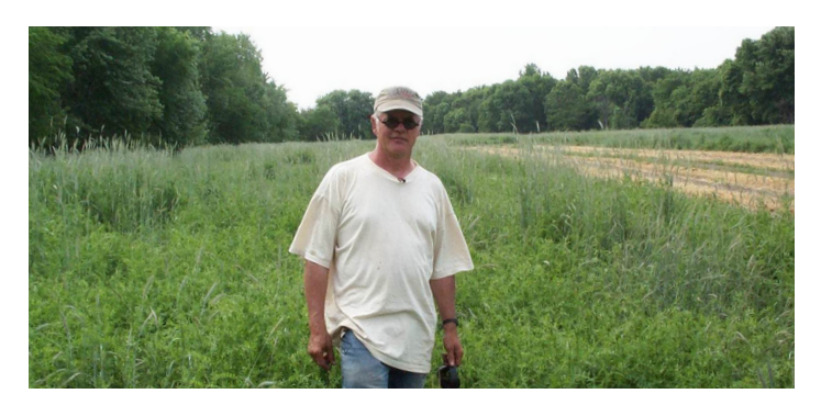
Legume Rotation Crop (Rye-Vetch Mix).

• Plant winter cover crops, such as winter rye, to help store soil nitrogen within the root zone, reducing nitrate leaching and leaving more nitrogen available for cash crops.