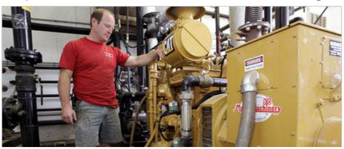
Anaerobic digesters turn animal wastes into valuable fuel.

for running electric fences, water pumps, and other farm equipment, especially in remote locations.