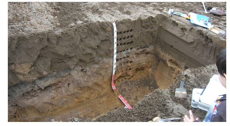
Soils store carbon in the upper organic layers.

• Reduce tillage to minimize soil aeration, which stimulates the breakdown of organic matter and releases CO2.