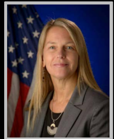
Dr. Dava Newman National Aeronautics and Space Administration, Deputy Administrator