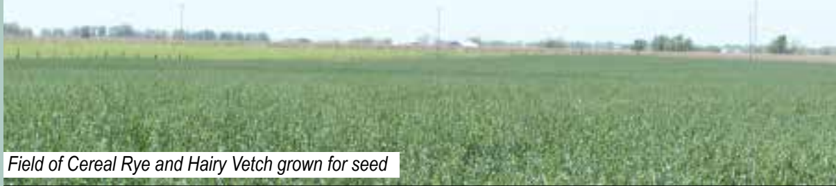
Field of Cereal Rye and Hairy Vetch grown for seed

Costs and benefits are highly variable from operation to operation. The information presented here is provided as an introduction to the economic variables associated with adding cover crops for seed production to a corn/soybean operation. For an operation-specific analysis refer to the For More Information section.