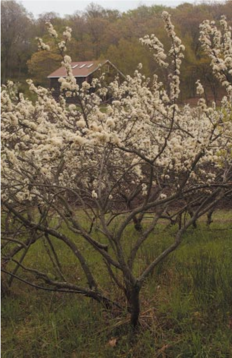
A 20-year-old beach plum in a mature orchard at Briermere Farms, Riverhead, Long Island.

tions has nearly ceased. So why develop beach plum as a new crop?