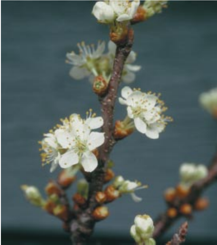
White flowers appear in mid May on reddish-brown twigs. They are pollinated by insects.

1524 recorded “damson trees” in what today is southern New York State. 2 Since then, several coastal land masses have been named after the beach plum: Plum Island, a barrier beach and conservation area near Newburyport, Massachusetts; Plum Island, an isolated speck of land off the northeastern tip of Long Island, New York, which is home to the USDA’s Plum Island Animal Disease Center; and Prime Hook, a barrier beach in Delaware whose anglicized name is derived from the Dutch settlers’ Pruime Hoek , which would more correctly translate to Plum Point.