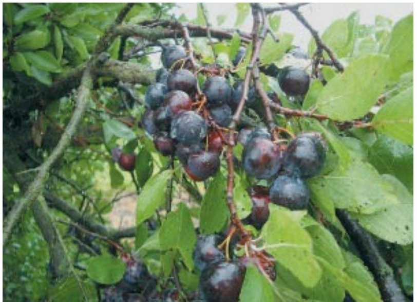
The fruits of Prunus maritima are small plums—one-half to an inch (1.5 to 2.5 cm) in diameter—that ripen from late August through September.

In 1996 I began to study Prunus maritima for my doctoral dissertation in horticulture at Cornell University. I was fascinated by this long-lived species' ability to thrive in environments with salt, apparent drought, and frequent disturbance, where its neighbors are often short-lived, stress-tolerant herbaceous plants like American beach grass ( Ammophila