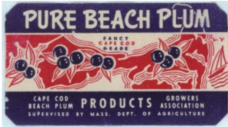
In 1952—to protect identity and guarantee quality—the Cape Cod Beach Plum Growers Association obtained a Massachusetts Department of Agriculture state grade label for their products.

for work done on other native fruits—a stipulation Jewett originally included on advice of Arboretum staff.)