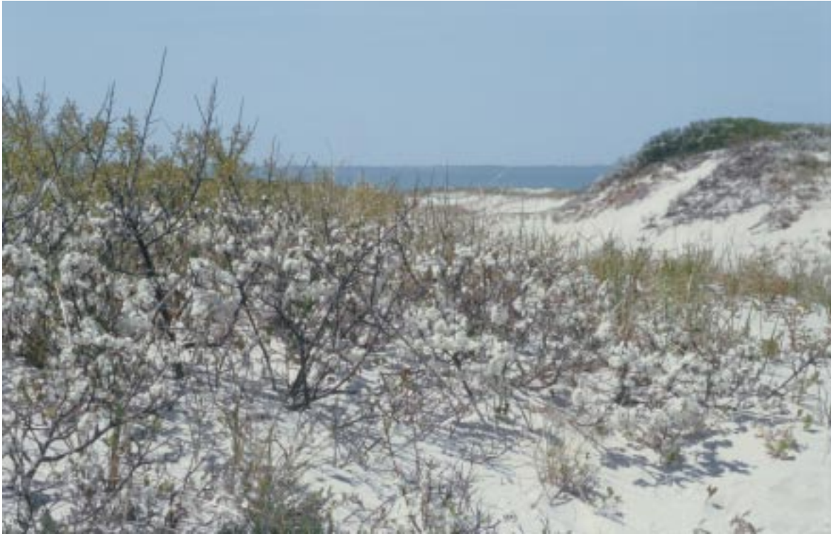
The shifting sand of coastal dunes often partially buries the plants.

species. Improvement of native plums began only when the population of the country spread into climates such as that of the prairie states and the South, where old-world plums could not survive. 12