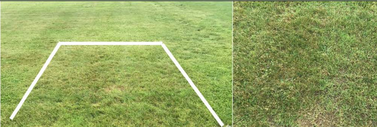
SpeedZone @ 1.5 fl oz / 1000ft 2