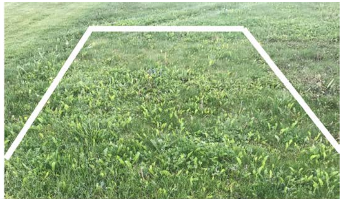
Branch Creek Weed Shield @ 10 fl oz + NIS/ 1000ft 2