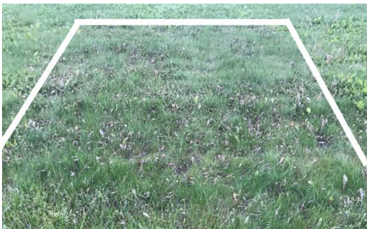
Fiesta @ 25 fl oz / 1000ft 2