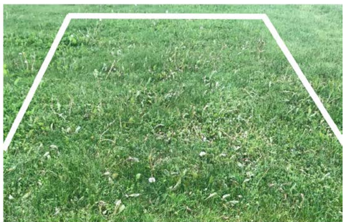
SpeedZone @ 1.5 fl oz / 1000ft 2