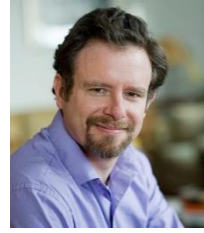
Ed Baptist History