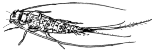
Firebrat ( Thermobia domestica )

Silverfish and firebrats are common indoors throughout the United States. Both are active at night and hide during the day. In apartment buildings these insects follow pipelines from the basement to the rooms on lower floors where they find food. They may be found in bookcases, around closet shelves, behind baseboards, and behind window and doorframes.