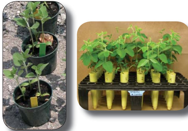
Fig. 1. Examples of soybean bioassay plants grown and maintained by a grower outside an onion storage facility (left) and in cone tubes in a research greenhouse (right).

Bioassaying your soil using soybean to detect root-lesion nematode infestation levels is only as accurate as the thoroughness of the sampling procedure and the number of composite soil samples collected. Therefore, the more soil samples collected per field the greater the understanding of the root-lesion nematode distribution within the field and the accuracy of the infestation level. The bioassay is an additional tool for managing the root-lesion nematode on an as-needed basis and it will contribute to reducing nematode damage and ultimately increasing profitability.