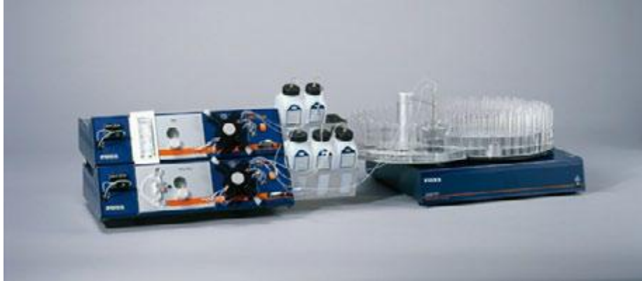
A Foss Fiastar. Sure, it's state of the art, but the A/O setup has the whole mad-scientist thing going on.

valve into the ampoule. Titrets ® are designed to be used with dry, white wines, and ascorbic acid and tannins can result in erroneously high readings. CHEMetrics suggests that error can be as high \pm 10 ppm and that any reading higher than 40ppm be confirmed with an alternate method.