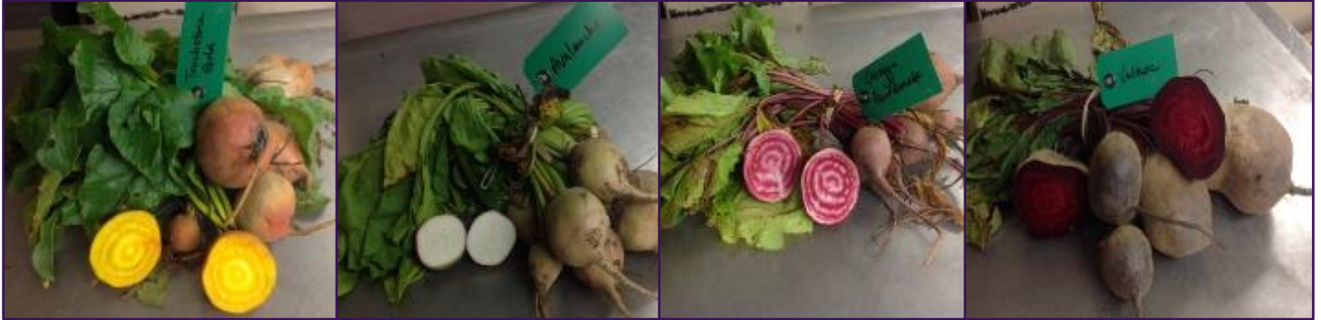
Table beet cultivars vary in their agronomic characteristics (e.g. root size, color, and shape) and susceptibility to CLS. In our research, all table beet varieties were susceptible to CLS. Boldor, Detroit, Falcon, Merlin, Rhonda, and Touchstone Gold were of similar susceptibility. Ruby Queen was slightly less susceptible.